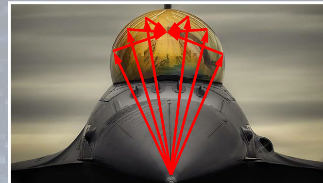
Modern Canopies Have Treatments that Trap Radar Emissions Inside